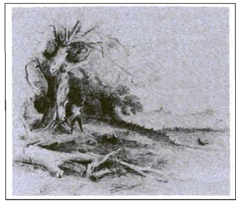
Sketch by Kate Douglass, 1872

"It was argued that eight walls contain more space than four walls in the same circumference. It was believed that with windows on eight sides, some would always be facing the sun and there would be a lot of ventilation and better crossventilation, things seen to be important to good health.