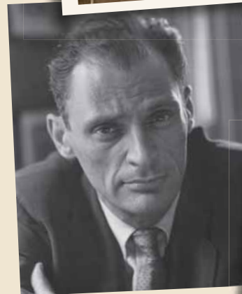
Playwright Arthur Miller retained a close association with the University of Michigan and Ann Arbor throughout his life.