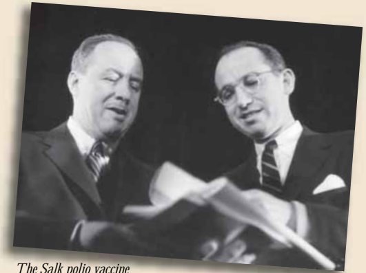
The Salk polio vaccine was announced in Ann Arbor on April 12, 1955.