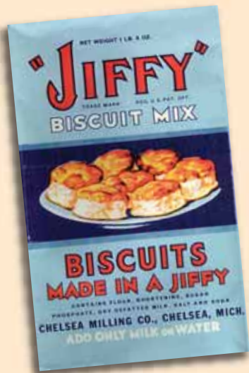
The world-famous Jiffy Mix from the Chelsea Milling Co. has been a Washtenaw County icon for over 75 years.

the smells of your neighborhood grocery, or pulling down a piece of string to wrap packages? Remember the smell of steam trains, your first car and your first love? Remember riding a streetcar, running to watch a fire, or walking to school? These are some of the thousand local stories that the Museum on Main Street tells through its exhibits on various aspects of life in Washtenaw County.