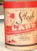
Ann Arbor's very own brand of lard from Steeb Bros.