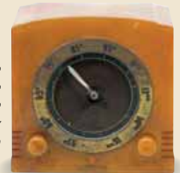
Inexpensive Kadette Radios were manufactured for the masses in Ann Arbor by the International Radio Corporation.