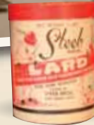
Ann Arbor's very own brand of lard from Steeb Bros.